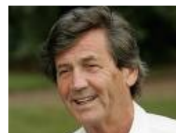
Lord Melvyn Bragg

The conference will provide a unique opportunity for listeners, viewers and licence fee payers to hear and question these key players on the full implications for its many programmes and services of the BBC’s Strategic Review and about the future of the arts on terrestrial television. Just how many constraints will there be on the creativity, ambition and freedom of programme makers in the more competitive world that will follow digital switchover? How will broadcasting and the arts fare under a new Government?